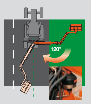
Hydraulic break-back with accumulator controlled autoreset facility (SRA)